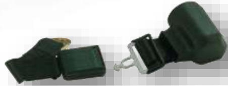
Seat belt reminder