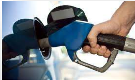
Follow up fuel consumption and CO2 emissions