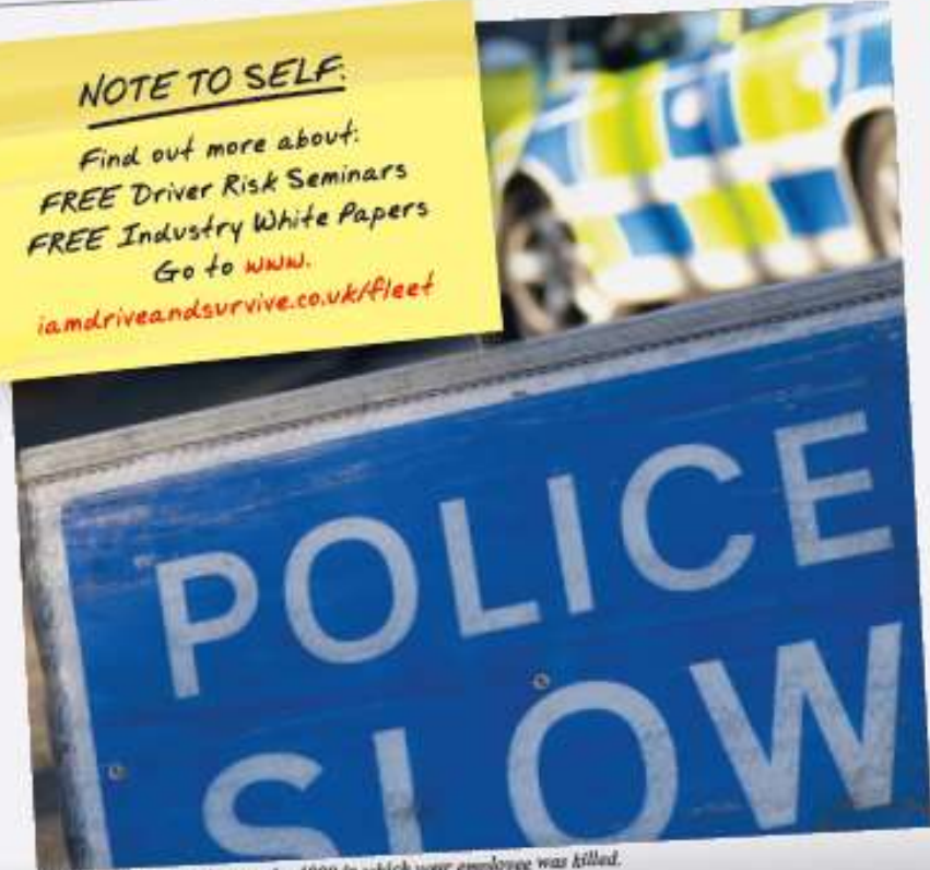
The scene of the incident on the A999 in which your employee was killed.

NOTE TO SELF. Find out more about: FREE Driver Risk Seminars FREE Industry White Papers Go to www.iamdriveandsurvive.co.uk/fleet