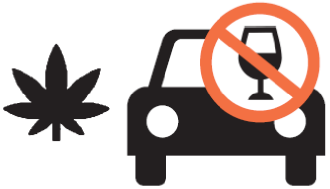
Risk factors affecting taxi drivers