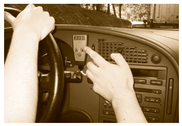
Car equipped with ISA

For all these reasons ISA is a mature technology that should be pushed forward. As a first step, national authorities responsible for road network management should develop a digital database of all the speed limits on their network and make this database available for GPS application. Industry's efforts should also be promoted by supporting additional research and standardisation. Member states could introduce tax cuts as incentives to install ISA and act as a role model by becoming first customers of ISA technology (ISA on public authorities' fleets). Further, ISA could be introduced using 'sticks' (e.g.: requiring speeders or young drivers to fit their vehicles with ISA). As a second step, Intelligent Speed Assistance could become mandatory by law.