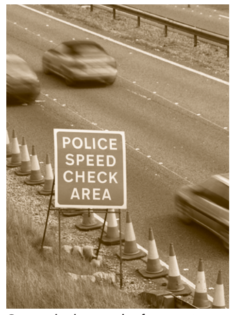
Communicating speed enforcement

This Recommendation asked countries to apply in a national enforcement plan what is known to be best practice in the enforcement of the three key areas of speed, drink driving and seat belt use. To control speed, automated enforcement systems must be used and offences must be followed up by procedures able to manage with a large number of violations. The EC Recommendation certainly helped to raise the profile of traffic law enforcement in the EU and has led to improved co-operation between different actors. The Recommendation also stated that by 2007 the Commission would evaluate progress in countries and if improvements are not sufficient that the Commission reserves the right to propose more binding legislation.