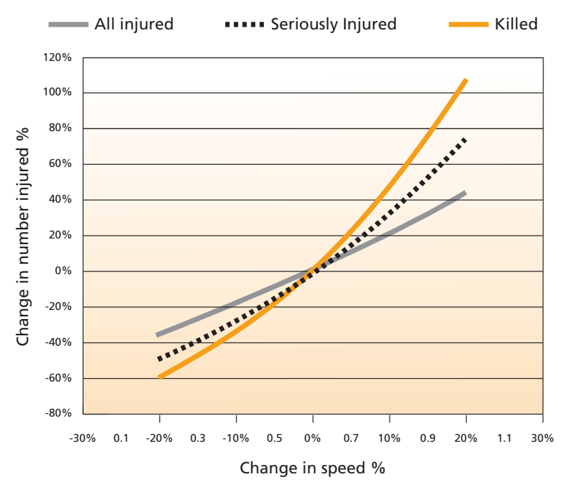
Figure 1: relationship between change in speed and change in the number killed and seriously injured (Nilsson, 2004a)

While the risk linked to speed varies across road types, a sound rule of thumb is that, on average , a 1% reduction in the mean speed of traffic leads to a 2% reduction in injury accidents , a 3% reduction in severe injury accidents and a 4% in fatal accidents (Aarts and van Schagen 2006, based on Nilsson 1982). It follows from the high risk associated with speed that reductions in driving speeds (even minor ones) will make an important contribution to reducing the numbers of road traffic deaths and injuries. Speed management is therefore a key element in reaching the EU road safety target.