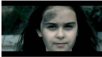
"Road Safety Anytime, Anywhere" Primary Schools