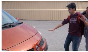
"Road Safety: a shared responsibility" Secondary Schools