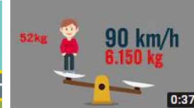
Video spots for secondary students