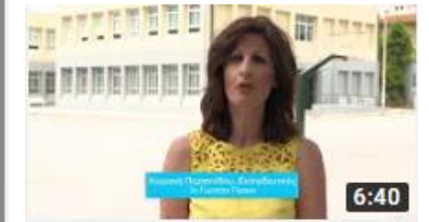
documentaries for teachers